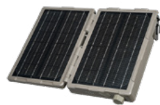
Folding Solar Panel